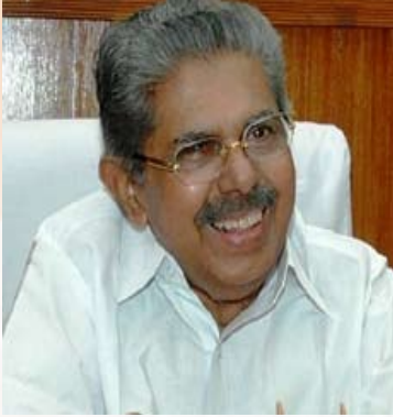
Vayalar Ravi Minister for Overseas Indian Affairs and Civil Aviation

The Pravasi Bharatiya Divas (PBD) has emerged as the flagship event of the Ministry of Overseas Indian Affairs. The PBD provides a platform that facilitates the overseas Indian community with their skills, expertise and financial resources to partner with us and place India on a higher growth trajectory .